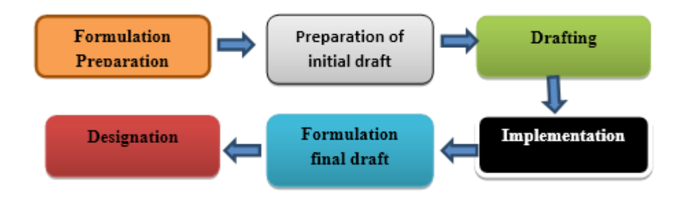
Figure 1. The flow of RPJMD (Medium-Term Regional Development Plan) preparation:

Source: Article 16 of the Regulation of the Minister of Home Affairs of the Republic of Indonesia Number 86 of 2017 concerning Procedures for Planning, Controlling and Evaluating Regional Development, Procedures for Evaluating Draft Regional Regulations Regarding Regional Long-Term Development Plans and Regional Medium-Term Development Plans, as well as Procedures for Amending Regional Long-Term Development Plans, Regional Medium-Term Development Plans, and Regional Government Work Plans.